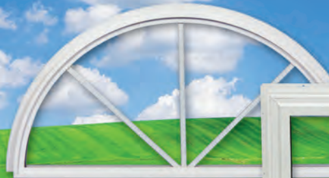
Series 520VH Half Round Fixed Window