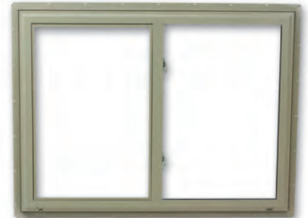
Series 900VH Horizontal Sliding Window