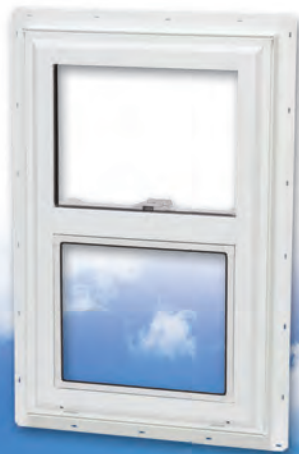
Series 500VH Single-Hung Window