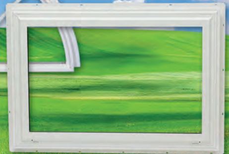
Series 905VH Fixed-Lite Picture Window

The New EZ-V™ Trim System is an industry first from AJ Manufacturing. The patent pending design permits the installation of a typical residential vinyl window into a steel clad post frame building with a fully trimmed panning frame that will accommodate the raised ribs of the building skin. All fasteners are concealed for an attractive installation. The design consists of vinyl PVC extrusions functioning as J-Channel header and sill, vertical nail fins and vertical trim caps.