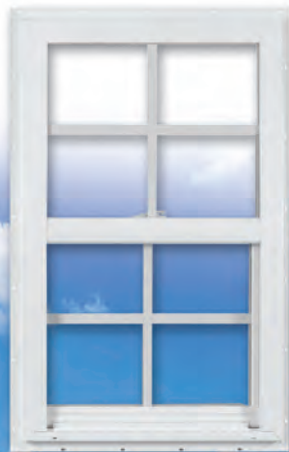
Series 600VH Double-Hung Window