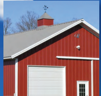
Perfect for post frame buildings with an interior ceiling.