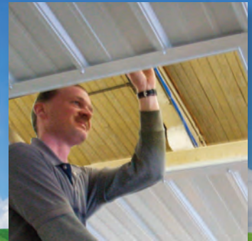
Large opening for easy attic access.