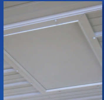
Durable finish and energy efficient.