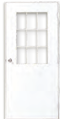
9-Lite (22"x 26")