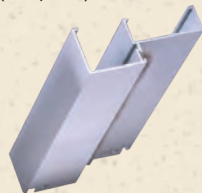
Nailing Fin J-channel Jamb (3150 and 3750)