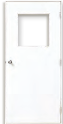
Vue Lite (22"x 22")